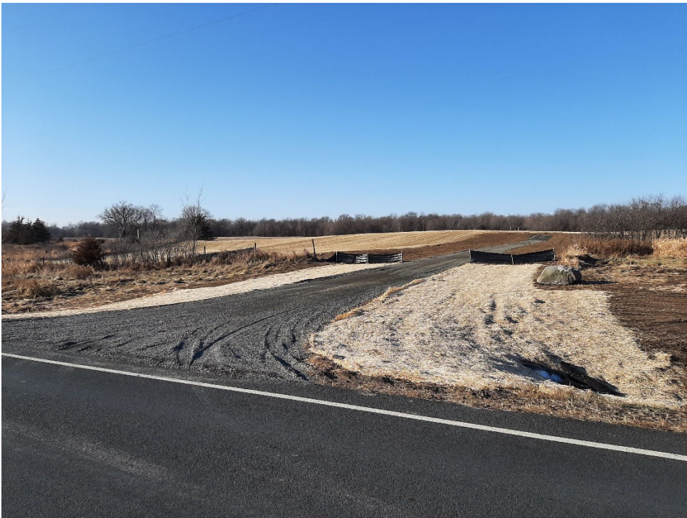
Example of a Completed Private Access