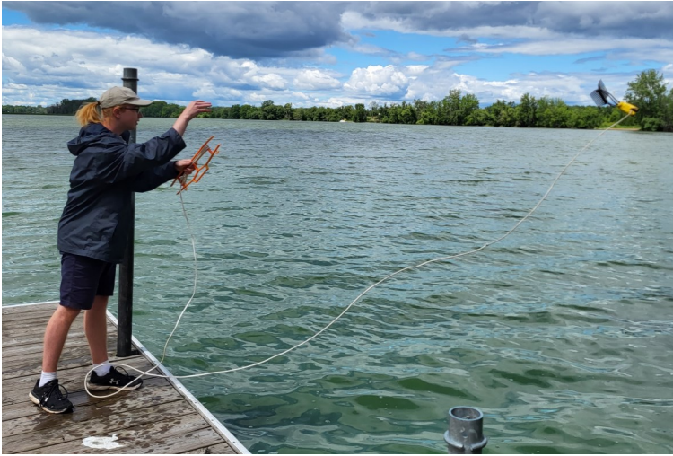
Chisago County Staff Using Double-Sided Rake to Sample for Aquatic Plants

In 2019, Chisago County launched a program to monitor for new infestations of aquatic invasive species (AIS) located at public water accesses in the county. The goal is to provide early detection and treatment if county staff discover previously undocumented infestations of AIS.