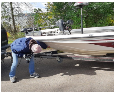
Chisago County Staff Performing Level 1 Watercraft Inspection

The goal of the Watercraft Inspection Partnership is to inform and educate the public on the threats of ecologically harmful aquatic invasive plants and animals. Watercraft inspectors work at public water access sites educating the public by providing information to watercraft users and conducting a brief survey while inspecting watercraft for invasive species.